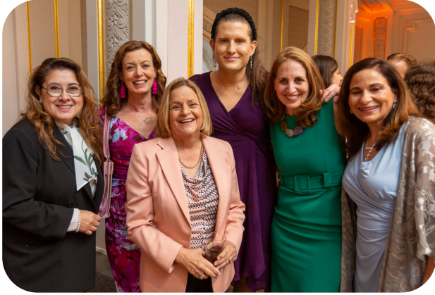
Running Start Board Members and supporters at the Young Women to Watch Awards