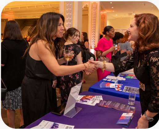
Alums make connections at a Job & Opportunity Fair in April 2024

Our alum community consists of talented early- and mid-career professionals. We connected alums to exciting professional possibilities through job and opportunity fairs. This also allowed our partners a glimpse into the richness of our network.