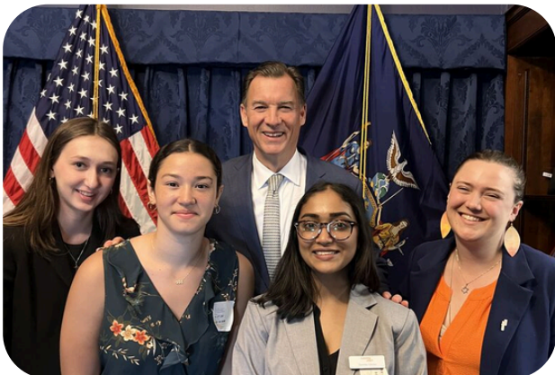
High school participants with Rep. Thomas Suozzi