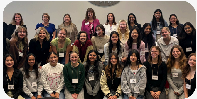
Elect Her training at the Poway, CA Unified School District

The majority of our 2024 trainings were facilitated by Running Start alums, giving them an opportunity to develop local community relations.