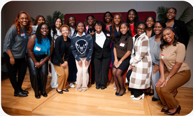
Participants at the 2024 HBCU Women's Leadership Summit

Recognizing that political leadership pathways are rarely linear, we provide ongoing support for our alumnae. We foster inclusive and supportive environments that nurture their growth and success. We are building a future where diverse voices will shape our political landscape and strengthen our communities.