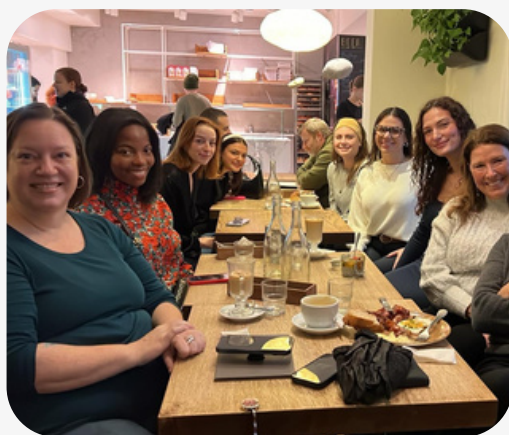
Alums and mentors at a networking dinner in November 2024

34 members in our 2024 delegation to the Reykjavik Global Forum