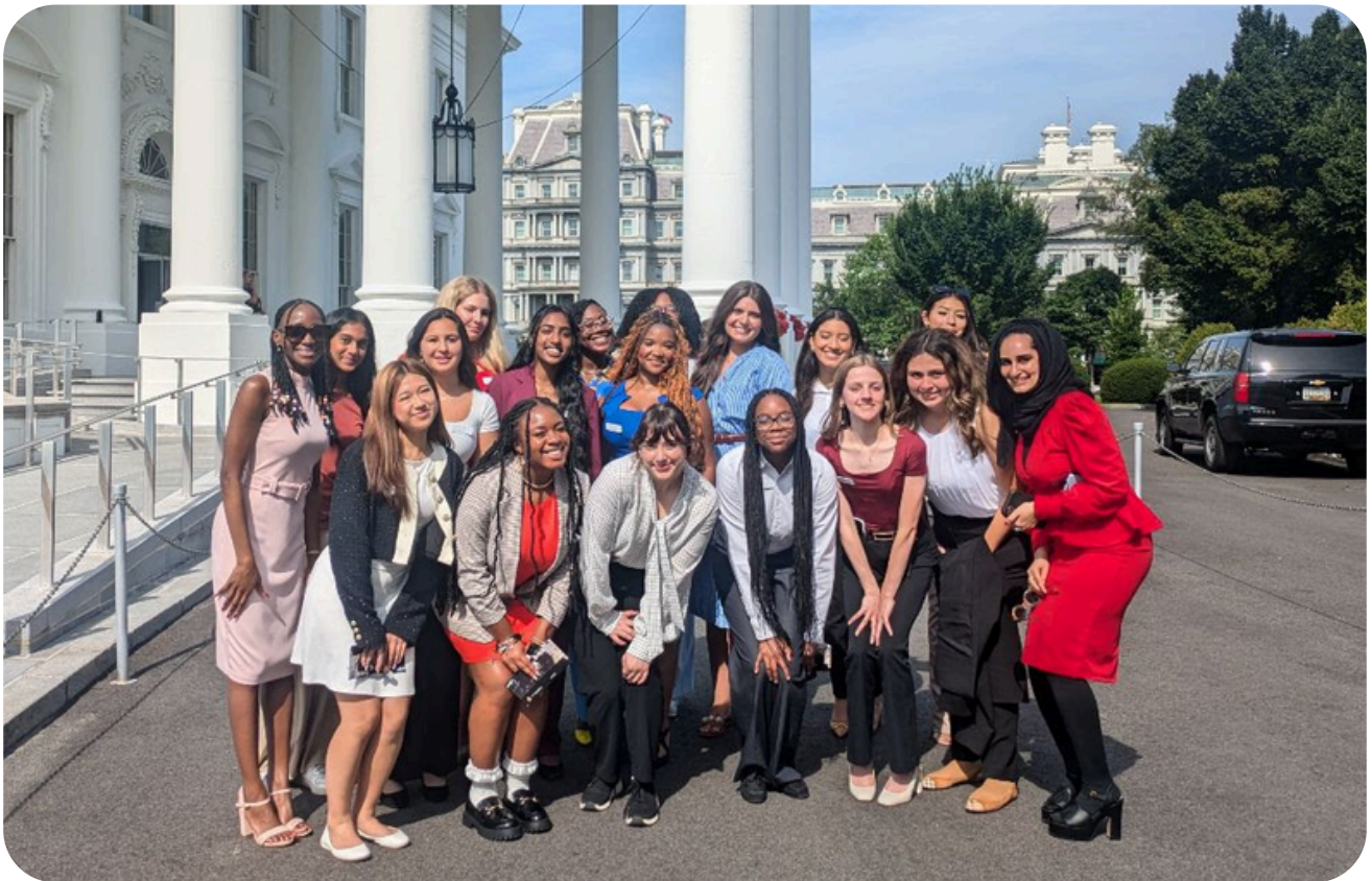
Running Start High School Program participants visit the White House in June 2024

Preparing next generation's leaders to change the world