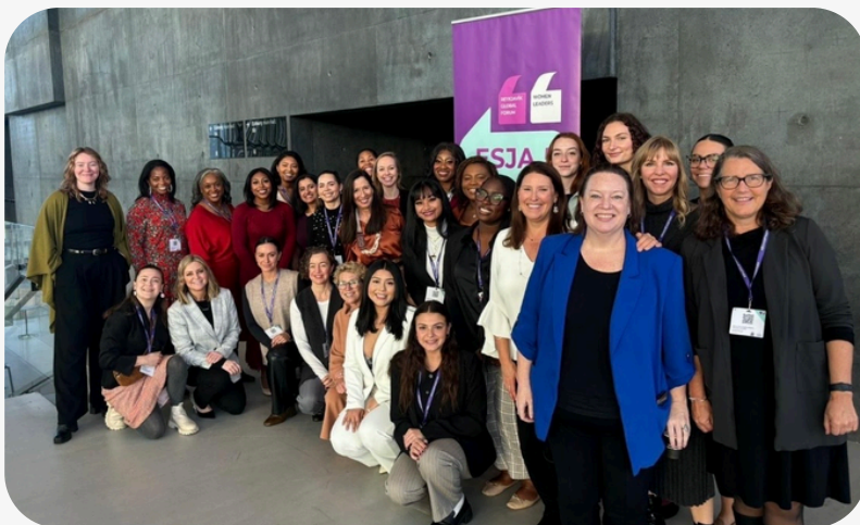
Running Start delegation at the 2024 Reykjavik Global Forum