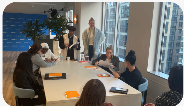
Fellows prepare for Capitol Hill visits with mentors from Walmart