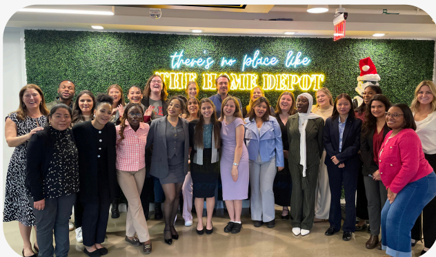
Fellows visit the Home Depot office during DC week

Akin American Hotel & Lodging Assoc. Brownstein DLA Piper King & Spalding Qualcomm Brides for a Cause EY Pacific Life Uber RBC Wealth Management