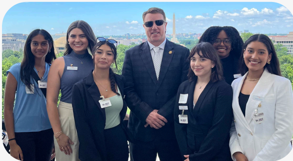
High School Participants with Rep. Pat Fallon